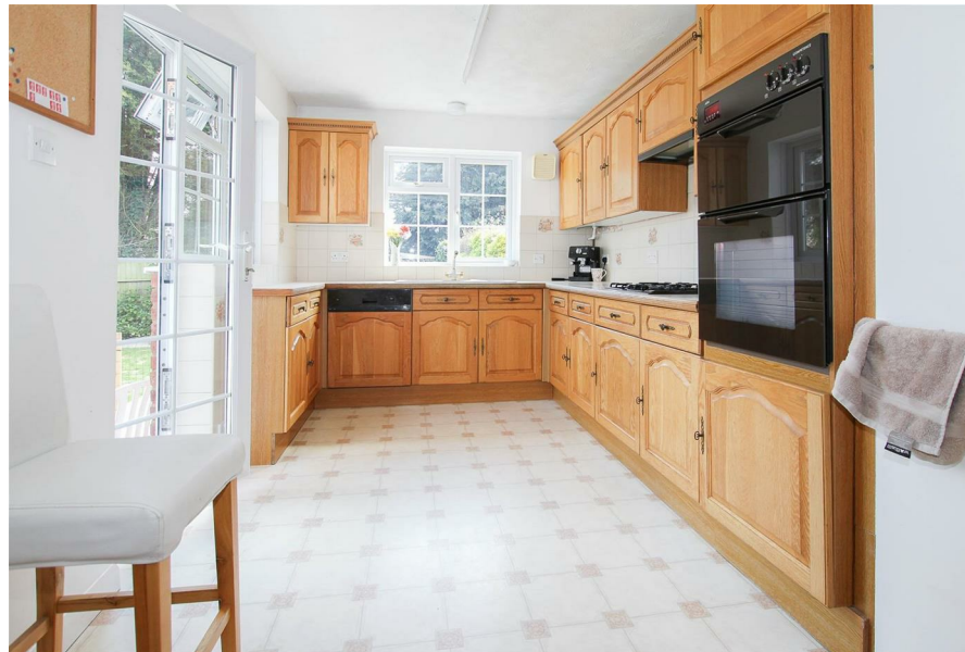
9 Hallam Close, Doddinghurst, Brentwood, CM15 0NW

Situated in an attractive cul de sac is this three bedroom semi detached house which has been extended to the rear providing a larger kitchen/breakfast room with appliances and has also had the garage converted into a separate dining room which has full building regulations. Further accommodation to the ground floor includes a through lounge with French doors onto the garden, a ground floor cloakroom, entrance hall with stairs leading to the first floor. There is also a nice spacious bathroom to the first floor which has both a bath and a shower cubicle. The property has a south facing easy to maintain garden approximately 36' in length commencing with a patio and with timber framed shed. There is also side pedestrian access. To the front is a block paved driveway with parking for two/three vehicles. The property has full UPVC double glazing throughout and gas central heating and is maintained in good decorative order.